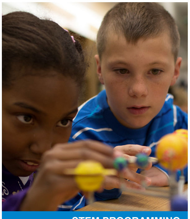
STEM PROGRAMMING (Science, Technology, Engineering, and Mathematics) occur two days each week.

74% are less likely to get into a physical fight